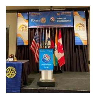
Front Stage