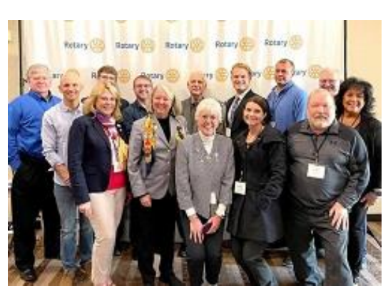
Congratulations to graduates and trainers of D5680s' inaugural Rotary Leadership Institute