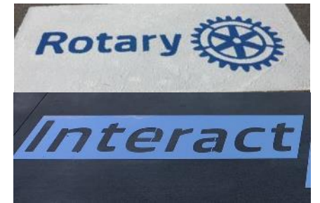
Stencil available for Rotary logo and Interact logo.