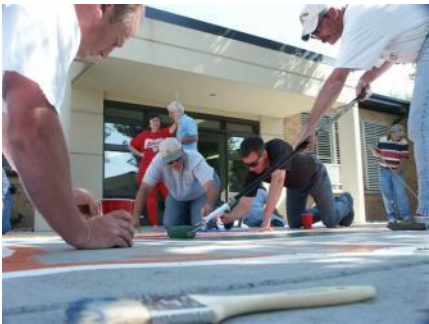
Sublette Rotary Club “gets down” to painting the map