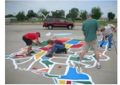
Ulysses Rotary Club colors in the states using 5 bright colors