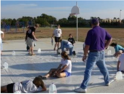
Interact Club helps West Wichita hold the stencil down – windy day!