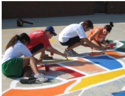
West Wichita Interact Club touches up at Lawrence Elementary