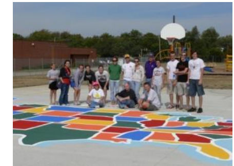
Beautiful finished product and proud volunteers