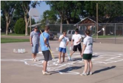
Johnson City and Interact Club outline the states