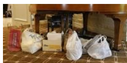
Just a few of our donations