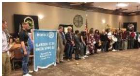
Interact Club Members

The annual Fall Feast went wonderfully for the Garden City Rotary Club .