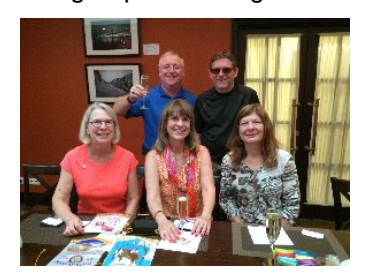
RC St. Petersburg Neva

The group is working on a more detailed story which will appear in a future newsletter.