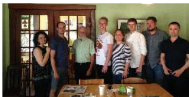
The team met with Rep. Ed Trimmer to discuss alternate energy sources being used in Kansas