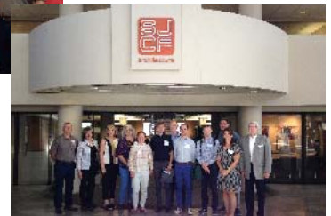
Visiting Architecture Firm