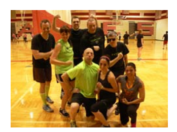
"FEAR to all Concerned"