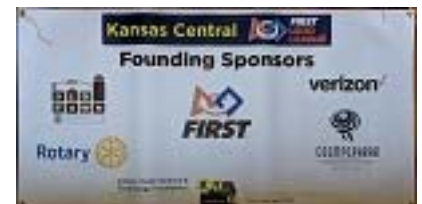
Old Town Wichita Rotary club members and signage were very visible at the event