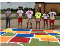
Lewis Elementary Map