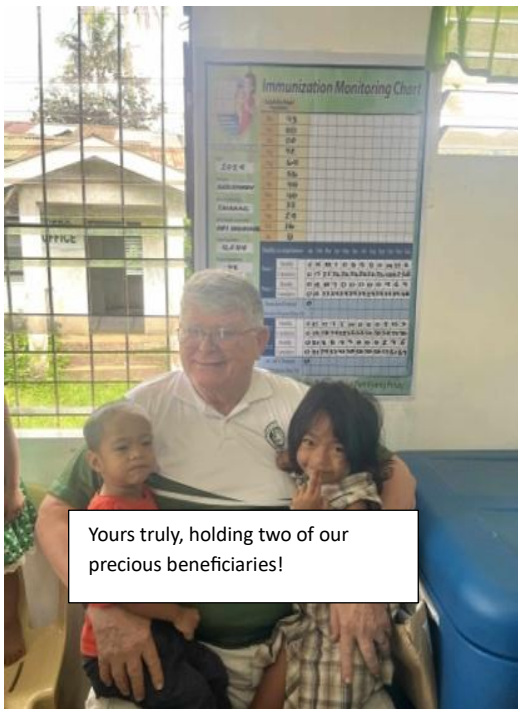
Yours truly, holding two of our precious beneficiaries!

and delivered both the vitamins and dehydrated meals to targeted villages. It is interesting to note that ingredients for our dehydrated meals are produced by the